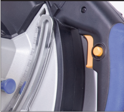
EVO230-HDX TRIGGER SWITCH