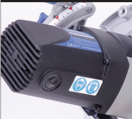
EVO230-HDX 1750W MOTOR