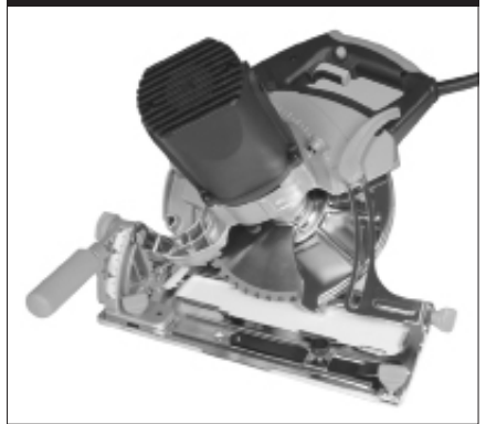
EVO230-HDX FIGURE 2