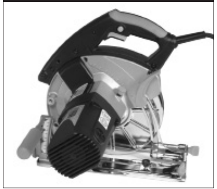
EVO230-HDX FIGURE 1