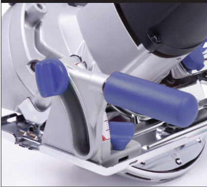
EVO230-HDX TILTING BLADE